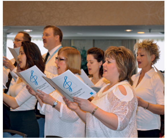
The divine service was transmitted to many of the 100 congregations in Canada.