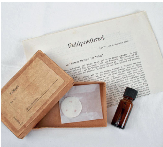
Below left: A letter to the frontlines containing a consecrated wafer, and a little bottle of wine Below right: Soldiers in the First World War lie in trenches during a break in the fighting