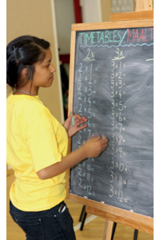
NAC Southern Africa