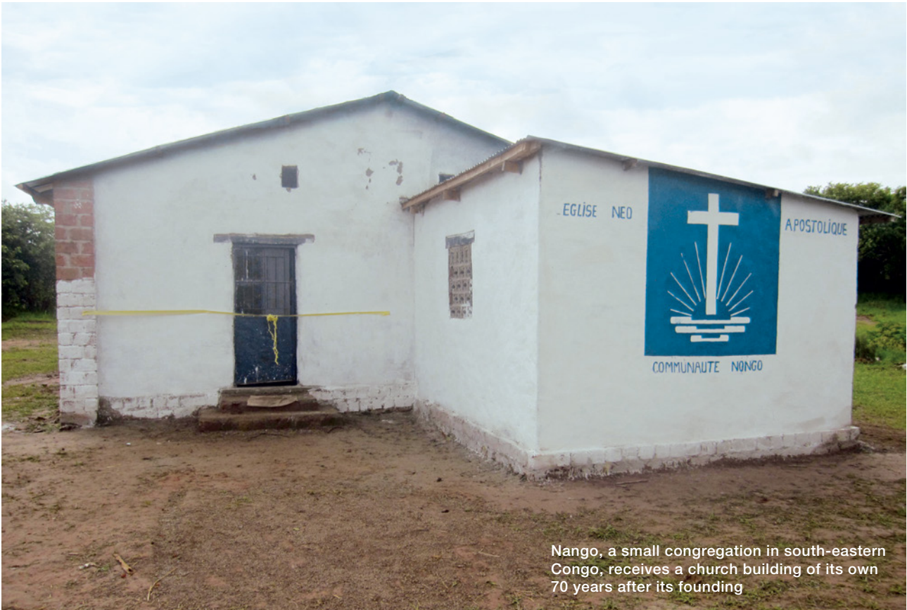
NAC DR Kongo